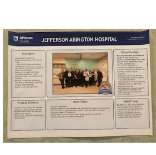
Jefferson Abington Hospital